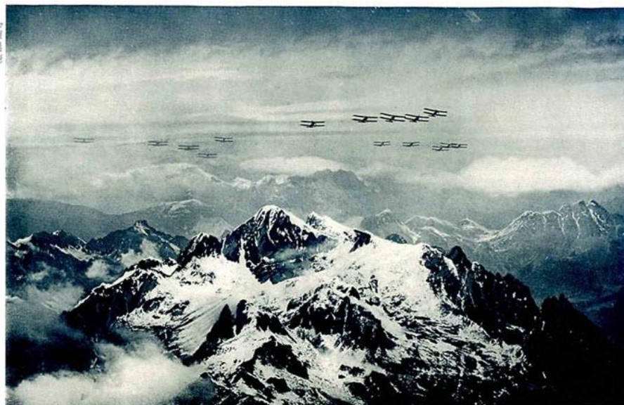
OVER THE ALPS IN AEROPLANES: BRITISH AERIAL SQUADRON FLYING OVER ITALY'S MOUNTAIN FRONTIER.